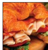
006 (croissant sandwich)