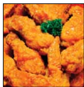
009 (buffalo wings)