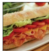
005 (sub sandwich)