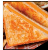
022 (grilled cheese)

Please select the desired photo (maximum of 1 per insert). For custom images please contact a sales representative at 1.800.203.0301.