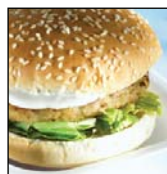
004 (fish file)