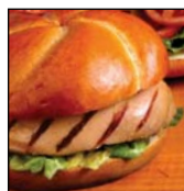
003 (chicken breast)