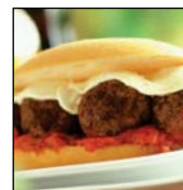
008 (meatball sub)