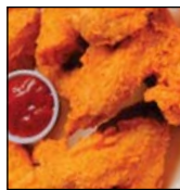
010 (fried chicken)