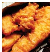
012 (fried fish)