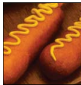
018 (corn dog)