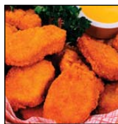
011 (chicken tenders)