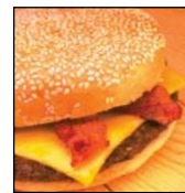
015 (bacon cheeseburger)