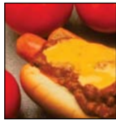
017 (chili dog)