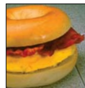
007 (bagel sandwich)