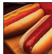
016 (hot dog)