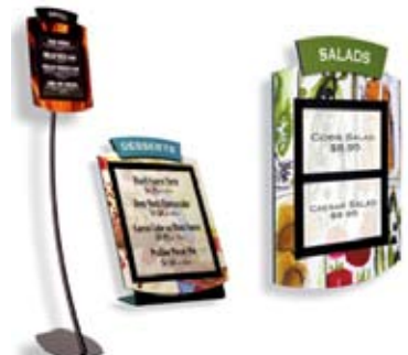
Variations® Menuboards and Displays