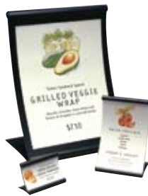
Concurva® Countertop Displays