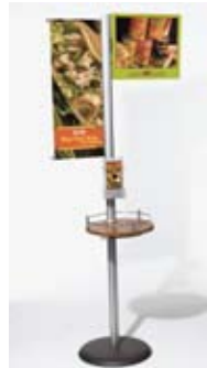
Ovations® Pole Displays