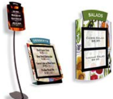
Variations® Menuboards and Displays