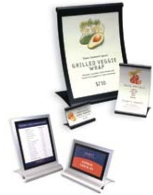
Item Identifiers & CounterToppers®

©2009 VGS Inc. All Rights Reserved The following are trademarks of Visual Graphic Systems Inc. CounterToppers®, MagaLens®, Sign-O-Matic™, VGS Eyecon Logo®