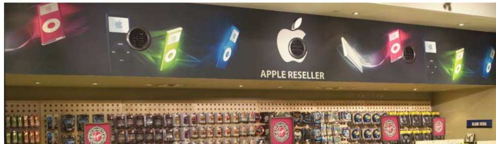
Wallpapers and Posters