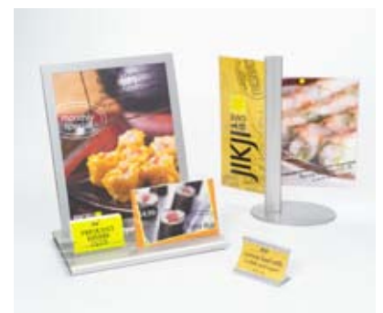
Item Identifiers & CounterToppers®

◀ Contains GripFlex® Technology that tightly holds graphic inserts in place