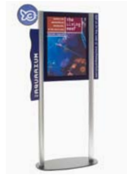
Xpressions™ 1.0 Freestanding Displays