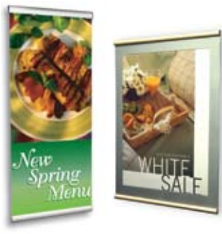
Banner & Wall/Ceiling Mounted