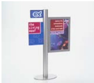
Xpressions™ 2.0 Table-top Applications