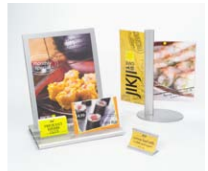
Item Identifiers & CounterToppers®

◀ Contains GripFlex® Technology that tightly holds graphic inserts in place