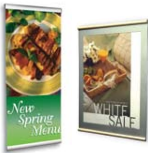
Banners & Wall/Ceiling Mounted