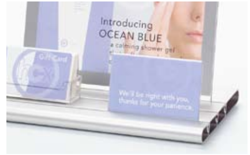
Highly Versatile Merchandising Displays